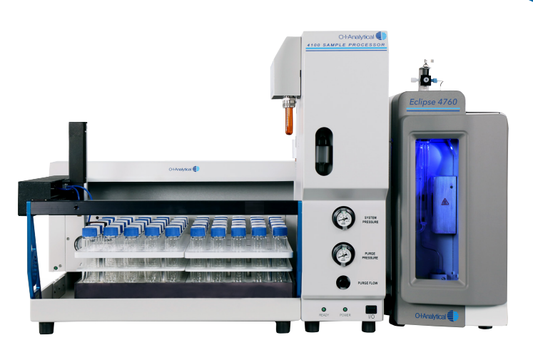
Eclipse 4760 P&T and 4100 Autosampler

Many VOCs can be analyzed by purge and trap concentration and detection by GC/MS. A variety of wines were analyzed by this technique. A calibration was run using commercially available compounds and a library search was performed on peaks not identified by the calibration method, i.e., tentatively identified compounds (TICs).